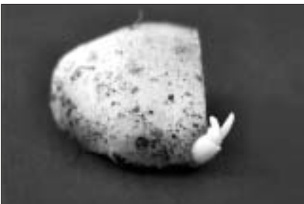
Fig. 4. Scale Haemanthus coccineus with adventitious bulb, 18 months after propagation

In the underside of a Crinum x powellii bulb, six incisions were made towards the nose. The bulb was kept dry at room temperature for three weeks. It was then planted in potting compost. Five months after propagation, leaves of newly formed bulbs were visible (Fig 7).