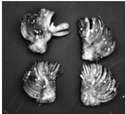
Fig. 6. Parts of bulb of Eucomis bicolor with newly formed bulbs, 13 weeks after propagation