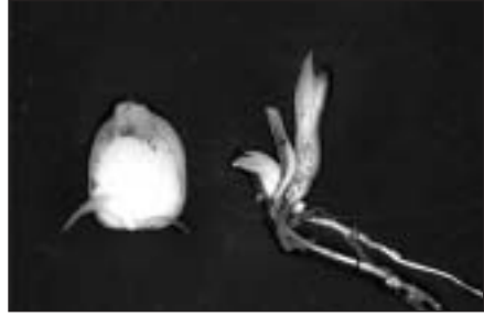
Fig. 2. Parts of Albuca sp., five weeks after propagation

added when necessary. After 13 or 17 weeks, the parts were removed from the vermiculite and planted in potting compost (commercial potting compost mixed with sand at a volume ratio of 3:1). The bulbs were placed in a light spot, but not in direct sunlight, and the soil kept moist, but not wet. The number of bulbs formed at the end of the growing season (both deciduous and evergreen types), as well as the size of the bulbs was recorded.