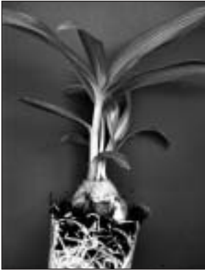
Fig. 7. Bulb of Crinum x powellii with three newly formed plants, five months after propagation