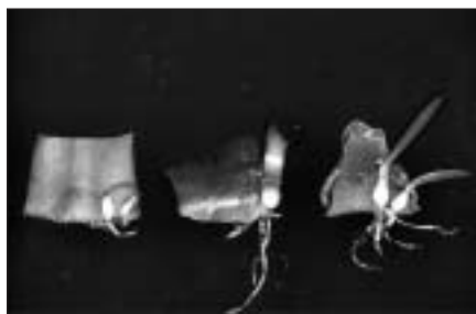
Fig. 8. Leaf cuttings of Haemanthus albiflos , four months after propagation. From left to the right: bottom part leaf, middle section and top part.

Moreover, the duration of the period during which the parts of the bulbs are kept in vermiculite seems to be a limiting factor to success. If this period is too long, the old parts may rot. Also, the newly formed bulbs produced roots that died off after planting. Experiments were conducted with Eucomis bicolor and a storage period of 13 and 17 weeks. The period of 13 weeks